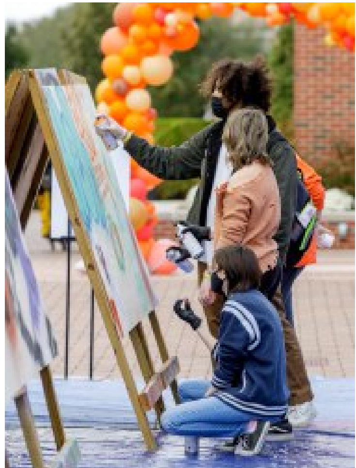
Spray Painting hosted by SUAB

The Student Arts Alliance would like to thank all of the artists for participating in the OSU Art Festival! We would also like to thank all of our sponsors and volunteers for making this event possible!