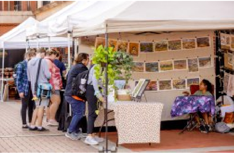
Easel N Ink by Dhruba