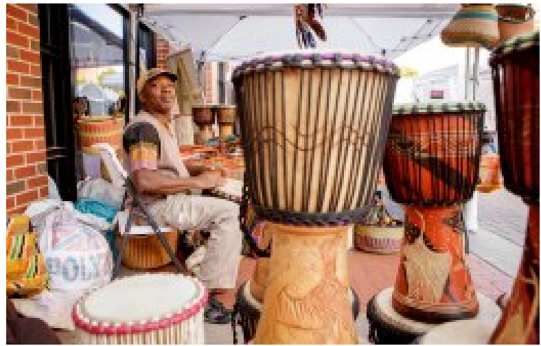
Agalu African Music